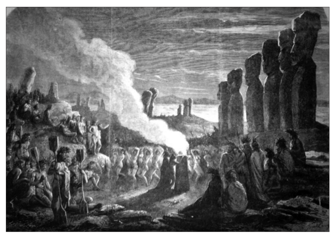
Fig. 1: Engraving of Pierre Loti's sketch made in Paris in 1872 (Loti 1872, 1025: 72).

Figure 2 comprises a massed, frenzied, native dance while the sculptures are brought down one by one;